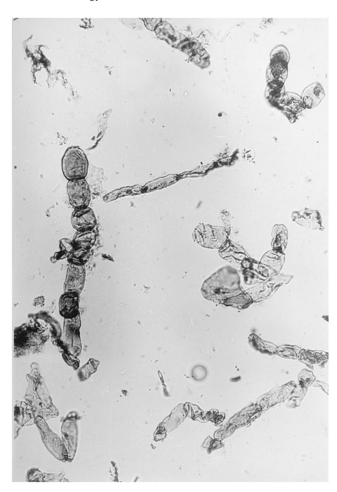
Fig. 1. Sedimentary organic matter assemblage with extreme dominance of fungal remains from the Tesero Horizon, Southern Alps, at the level of last occurrences of typical Late Permian faunal elements (18–21). ( \times 215.)

nonmarine deposits contradict concepts that the remains would represent marine rather than terrestrial fungi (46, 47). In some of the investigated basins, a fungal acme already serves as a practical bioevent for recognizing the P–Tr transition in subsurface exploration. It should be noted that the abundance