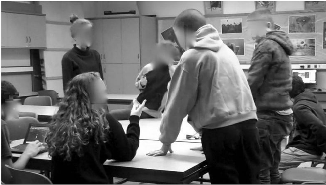
Figure 1. The leaders (seated, left) and players in the midst of heated discussion

although the meetings took place in a computer classroom with different norms during formal use. A typical scene illustrated in Figure 1.