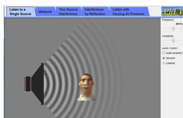
Figure 1. Simulation of sound wave propagation

The use of ICT was at the center of the course. Strong emphasis was paid to the use of computerized tools such as simulation and sound editing software, as is shown in Figure 1.