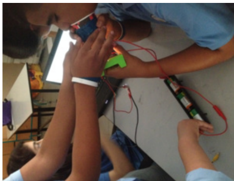
Figure 4. Students' team work in checking a microphone using the Audacity software