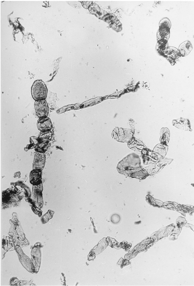
FIG. 1. Sedimentary organic matter assemblage with extreme dominance of fungal remains from the Tesero Horizon, Southern Alps, at the level of last occurrences of typical Late Permian faunal elements (18–21). (× 215.)

nonmarine deposits contradict concepts that the remains would represent marine rather than terrestrial fungi (46, 47). In some of the investigated basins, a fungal acme already serves as a practical bioevent for recognizing the P–Tr transition in subsurface exploration. It should be noted that the abundance